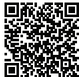
For Win Phone